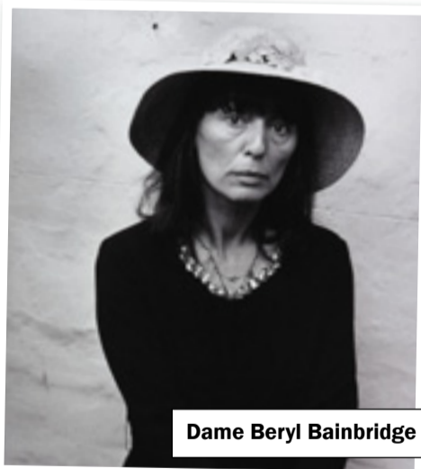
Dame Beryl Bainbridge